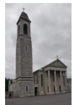
Our Lady of Lourdes Church

Monday to Friday 8.30am & 10.30am Tuesday St. Anthony's Novena 7.30pm Saturday 10.30am Vigil 6.15pm Sunday 8.00am & 11.00am Confessions: Wednesday & Saturday 12.30pm-1.00pm. Also 30 minutes before Saturday Vigil Mass