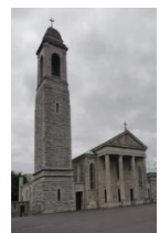
Our Lady of Lourdes Church

Monday to Friday 8.30am & 10.30am Tuesday St. Anthony's Novena 7.30pm Saturday 10.30am Vigil 6.15pm Sunday 8.00am & 11.00am